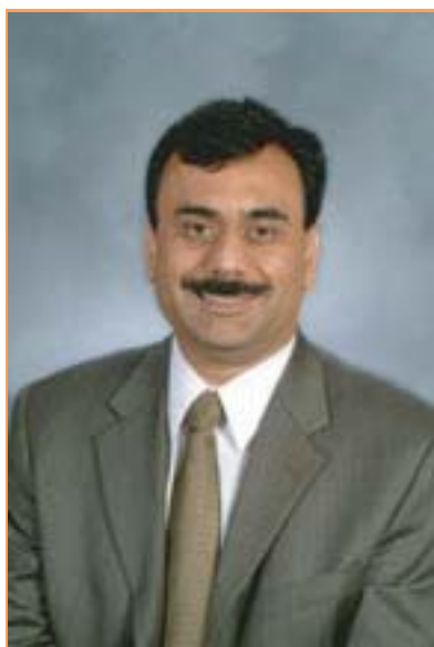
Dr. Ashutosh Tewari

Definition: Robotic Prostatectomy is a computer-enhanced minimally invasive surgery to remove the prostate. The procedure is typically performed through five-½ to 1 inch incisions in the abdomen. The abdomen is inflated with carbon dioxide gas to create space for the surgeon to work. The surgeon controls a robotic camera, that allows a 3-D magnified virtual reality image, and three separate mechanical arms (one controls an endoscope, the other two control instruments) that are inserted through the incisions. Controlled by exact finger movements, the robotic arms have more range of motion and precision than the human wrist, allowing the surgeon to separate critical nerves and blood vessels with a goal of reduced side effects, blood loss, pain, and recovery time. Based on short-term results, robotic procedures appear to have cancer control rates similar to standard radical retropubic and laparoscopic surgeries.